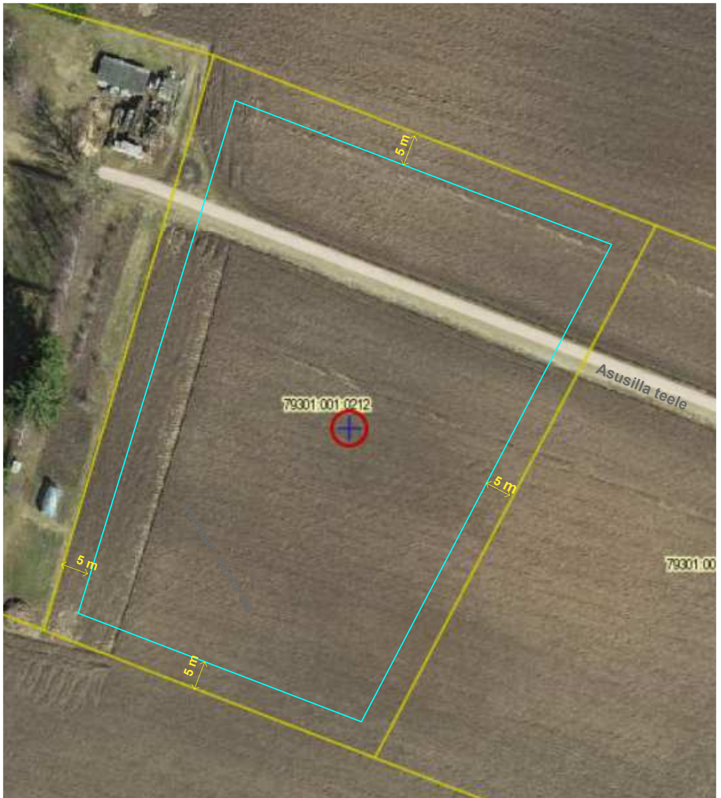
Lisa 1. Ehitusala skeem. PTH-18-176 Rõhu küla, Asusilla tee 1a